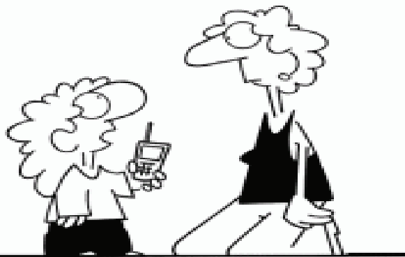
"If I send my prayer as a text message, will I get a faster reply?"

1. Mark 2. Luke 3. Acts 4. Revelations 5. James 6. Numbers 7. Job 8. Judges 9. Lamentations 10. Hebrews 11. Ruth 12. Peter 13. Kings 14. Amos 15. Esther 16. Titus